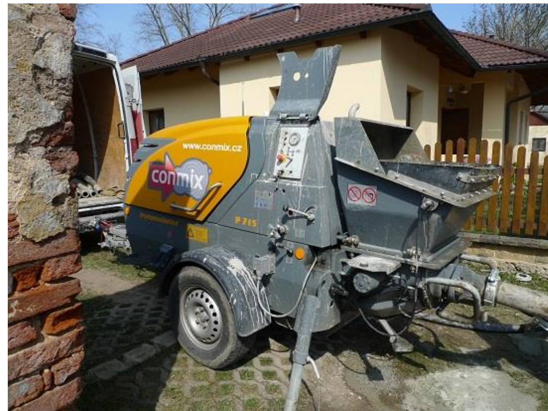
screw or piston pump