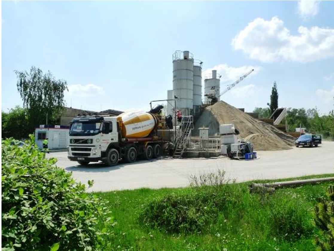
concrete plant with truck mixers